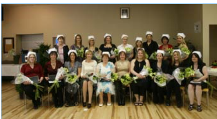
The proud graduating class of the first Seaforth Practical Nurse Program