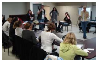
The first meeting of the Huron County Youth Council