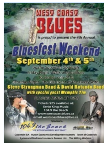
Poster for the West Coast Blues Festival