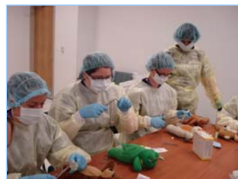
Eager MedQuest students