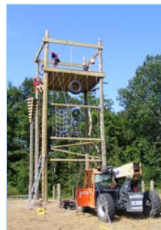
Construction begins on the Above the Falls Challenge Course