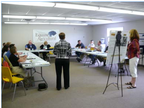
Creation of the Economic Development Blueprint begins