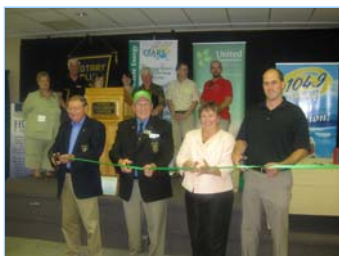
Another ribbon cutting