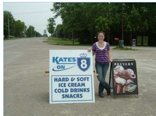
Another student runs her own business thanks to Summer Company